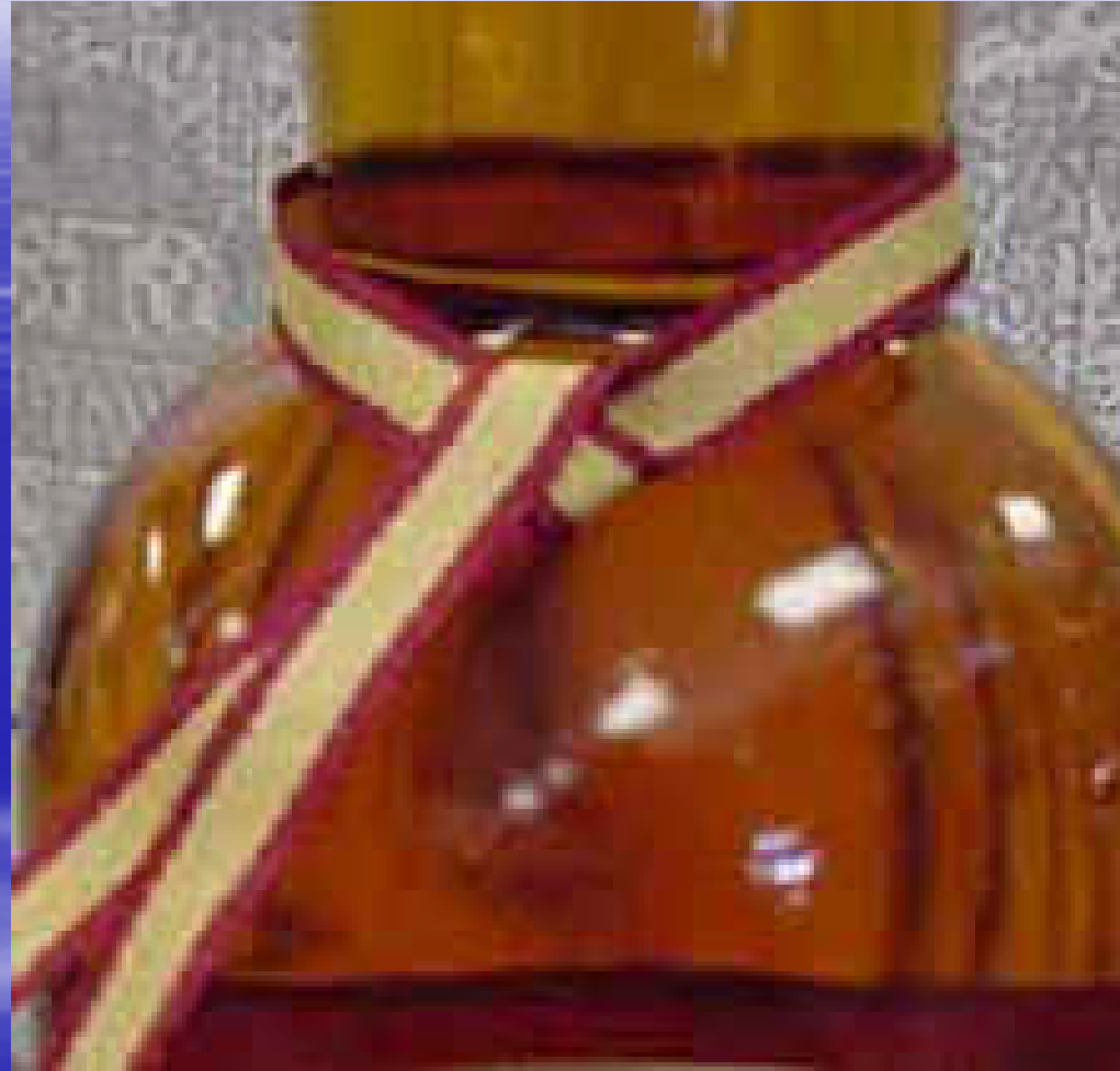
Short Timer's Ribbon